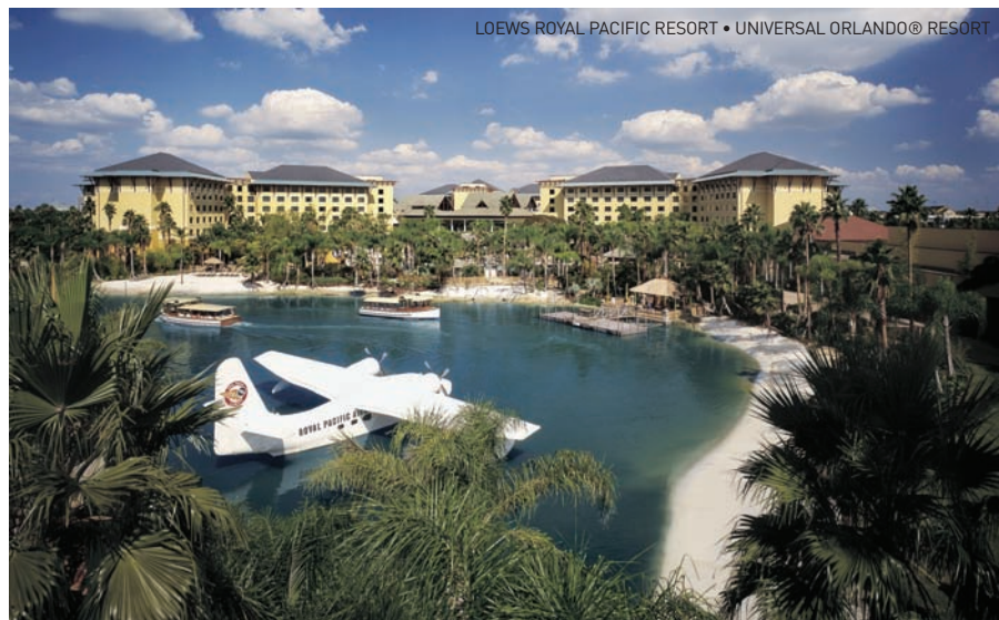
LOEWS ROYAL PACIFIC RESORT • UNIVERSAL ORLANDO® RESORT

out a live dueling piano show at Pat O'Brien's, hit the dance floor at Red Coconut Club, or karaoke with a live band as backup at CityWalk's Rising Star. One thing for sure, the night will be unforgettable. Lively, bright and colorful, CityWalk lights up like a Vegas strip at night and radiates with an energy that will race through your veins like caffeine.