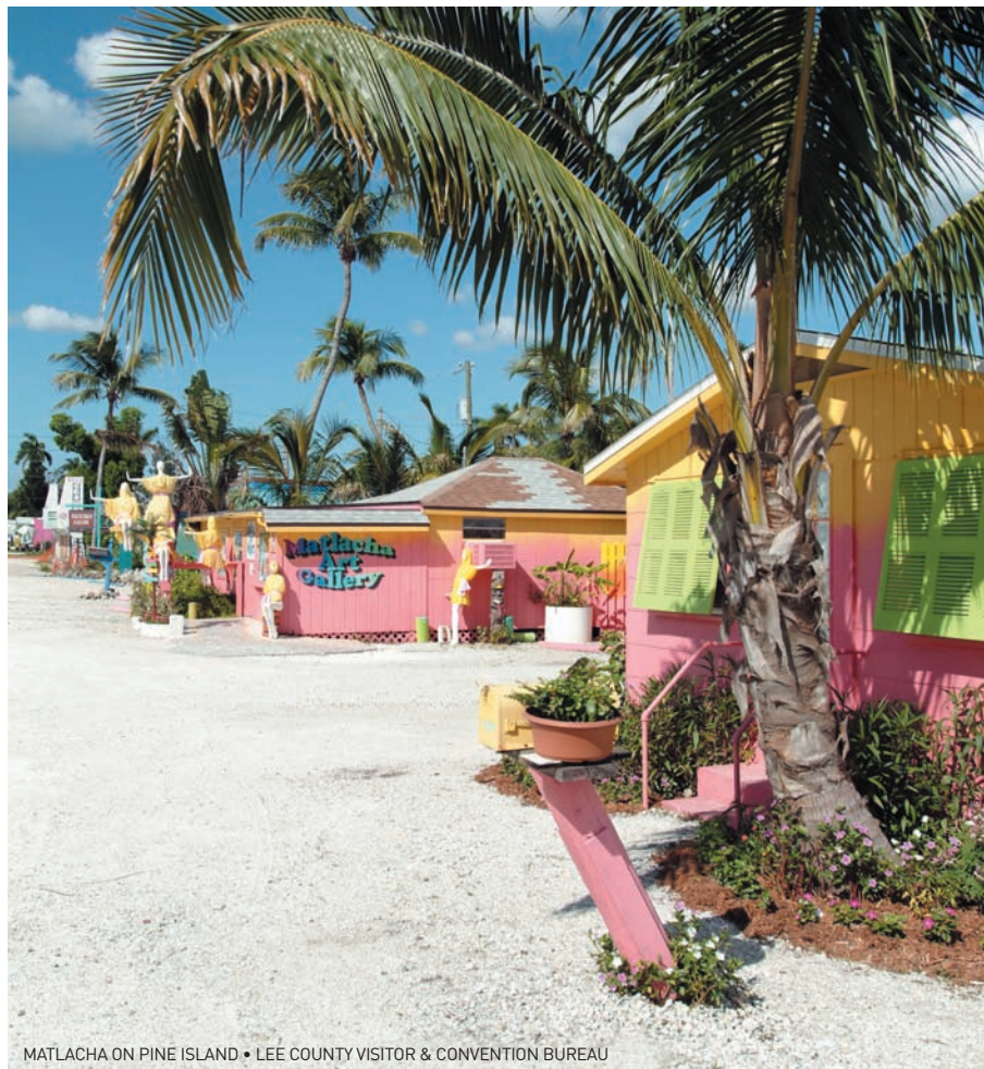
MATLACHA ON PINE ISLAND • LEE COUNTY VISITOR & CONVENTION BUREAU

Visit the quaint San Marco district, home to the Peterbrooke Chocolatier Production Center ( peterbrooke.com ), which gives chocolate lovers insights into the world of chocolate making during public tours. Finally, open Saturdays from March until December, the new Riverside Arts Market ( riversideartsmarket.com ) stocks a kaleidoscope of finds from original art to farm-fresh produce at its location under the Fuller Warren Bridge.