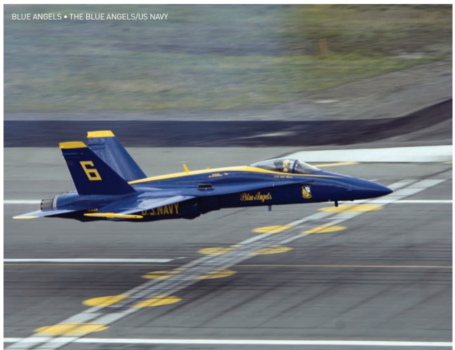
BLUE ANGELS

Experience Florida's only drive-through safari, Lion Country Safari ( lioncountry.safari.com ), where you can view more than 900 animals in seven themed areas, ride a camel, feed a giraffe or chill out in a mini water park. Visit the Flagler Museum ( flaglermuseum.us ), Henry Flagler's 1902 estate in Palm Beach, for guided tours and the legendary Gilded Age-style lunch featuring gourmet tea sandwiches and traditional scones served on exquisite Whitehall Collection™ china. Catch a polo match at the International Polo Club Palm Beach ( internationalpoloclub.com ) where the US Open Polo Championship is played each year.