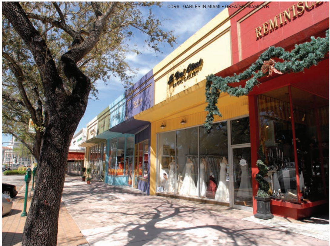
CORAL GABLES IN MIAMI • GREATER MIAMI CVB

parlor featuring ice cream created in seconds with a vanilla base that's flash frozen with liquid nitrogen. Be sure to visit Florida EcoSafaris ( floridaecosafaris.com ) at Forever Florida for nature tours on horseback through a 4,700-acre working cattle ranch and nature preserve. For thrill seekers, the ranch recently added a zip-line safari, which takes guests on a soaring treetop tour 55 feet above the ground.