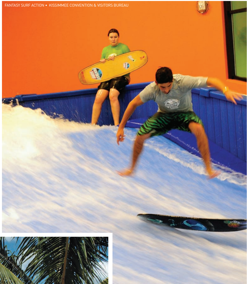
FANTASY SURF ACTION • KISSIMMEE CONVENTION & VISITORS BUREAU

Get a behind-the-scenes glimpse of the brewing process (including a sampling directly from a finishing tank) on the new Budweiser Beermaster Tour ( budweiser-tours.com ), an enlightening experience that's sure to turn the typical hoser into an ale aficionado. Hand-pull your very own candy at Sweet Pete's ( sweetpete.net ), historic Springfield's new all-natural candy shop.