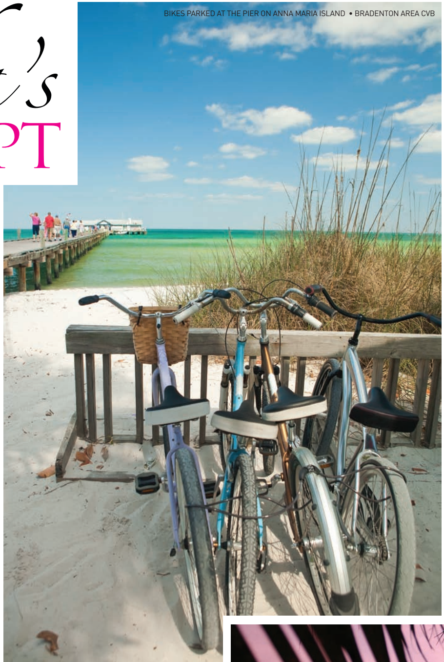
BIKES PARKED AT THE PIER ON ANNA MARIA ISLAND

Run your hands across sea urchins and calico crabs in the Intertidal Touch Tank at the South Florida Museum ( southfloridamuseum.org ) where area celebrity and the nation's oldest manatee, Snooty, can be observed in person or online via the "Snooty Cam." Meander through a whimsical collection of galleries, studios, boutiques and cafés housed in colorful cottages at the Village of the Arts ( villageofthearts.com ) in downtown Bradenton where one-of-a-kind finds from purses made entirely of recycled pop can tabs to handmade ukuleles turn typical shoppers into happy treasure hunters. Close the day Anna Maria Island-style at the Sun House Restaurant ( thesunhouserestaurant.com ) where every night diners serenade the sunset singing You Are My Sunshine and then down a complimentary "green flash" shooter.